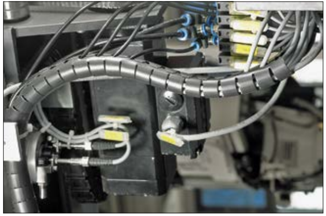
Cables can be branched off at any point for better, more flexible protection