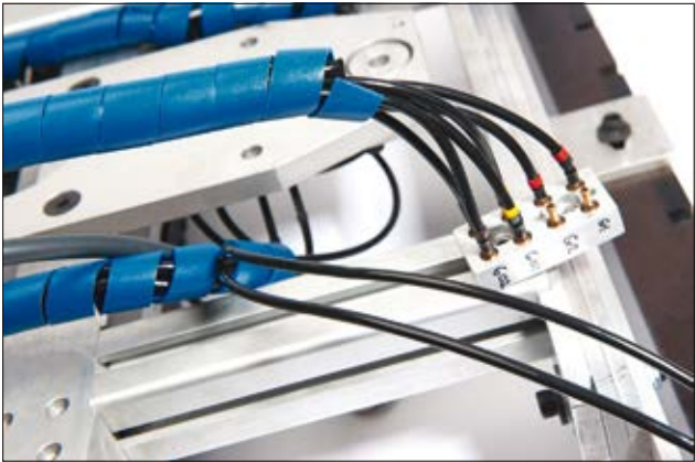
Detectable, metal-content spiral binding protects cables on food-processing machines.