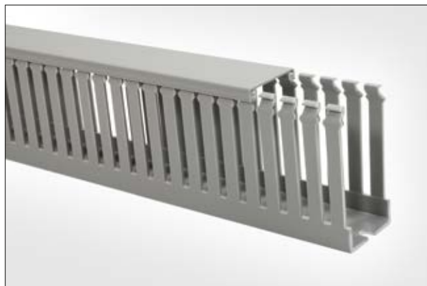
HelaDuct HTWD-PD - DIN sized wiring duct.