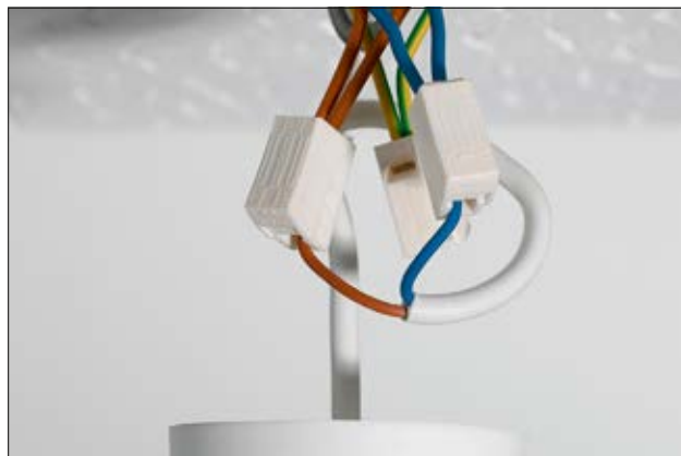
Quick installation and release of lights with HelaCon Lux.