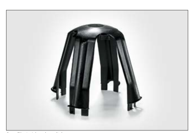
SpotClip-I: 4-leg downlight cover.