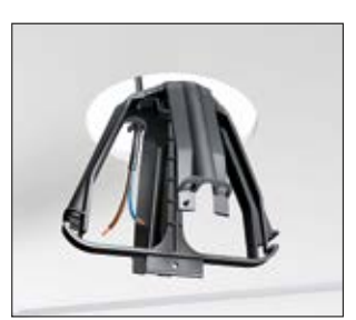
1. Use the delivered tool to install SpotClip in the fixing hole as easy as possible.