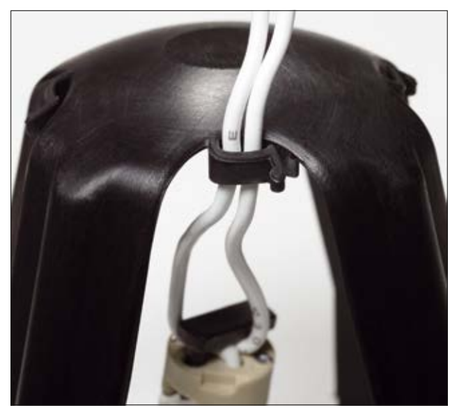
Cable retainers hold the downlight supply cable in place.