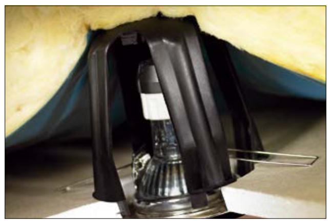
SpotClip-I ensures reliability and safety of lighting installations.

SpotClip-I is a unique solution developed for mounting halogen and LED downlights in plasterboard and ceiling tiles. This innovative 4-leg downlight cover offers outstanding safety and installation features and is suitable for use in both panelling and plasterboard ceilings. SpotClip-I is made from non-flammable, fibreglass reinforced polyamide, offering a range of thermal and mechanical benefits. It can be installed both during or after construction. The SpotClip-I downlight cover is an optimal solution for a wide variety of applications in existing and new buildings. It can be used in ceiling cavities with diameters of 62 to 90 mm and ensures the safety distance between the downlight, insulation foil and insulation material. SpotClip-I reduces the risk of damage caused to insulation material as a result of overheating and heat accumulation, while potentially increasing the life span of light bulbs.