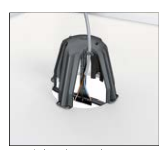
2. Push the spikes into the plasterboard to prevent shifting and disconnect the tool.