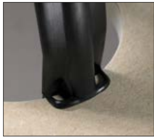
Support wings prevent SpotClip