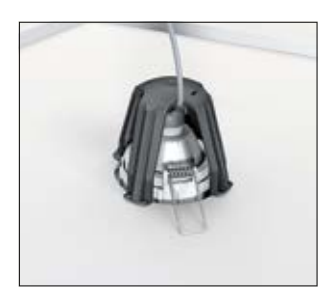
3. Start the installation of the downlight in a safe way.