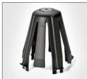
SpotClip-II downlight cover with 4 additional flexible legs.