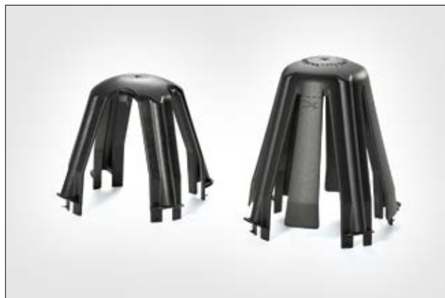
SpotClip-I and SpotClip-II for maximum downlight heights of 70 mm and 95 mm respectively.