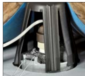
SpotClip-II shown using standard insulation wool.