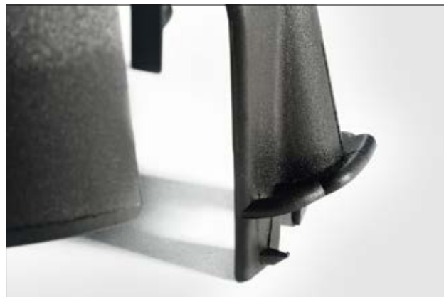
Retaining spikes and support wings hold SpotClip-II in the required position.