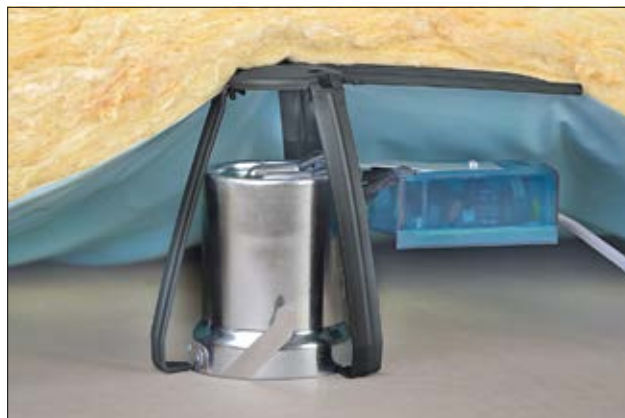
SpotClip-III for downlight application with external power supply.

This further development of SpotClip-II allows the use of an existing power supply. In the case of a spot without power supply, this added straight leg can be cut easily and removed manually. It helps to avoid contact between the insulation and the external power supply of the spot. SpotClip-III will fit to all standard applications with solid insulation material. It is delivered flat with flexible legs. They can be locked within seconds. The height of the this mounting device is depending on the fixing hole diameter. SpotClip-III is suitable for LED and Halogen downlights with a fixing hole diameter from 62 mm to 120 mm. The maximum product height is 130 mm depending on the fixing hole diameter.