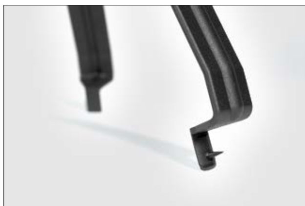
New leg design combined with retaining spikes for high stability throughout installation.