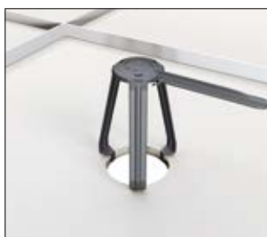
2. Press the spikes into the plasterboard to ensure stability of SpotClip-III.