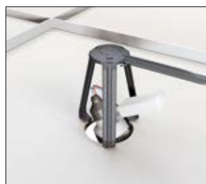
3. Install the downlight.