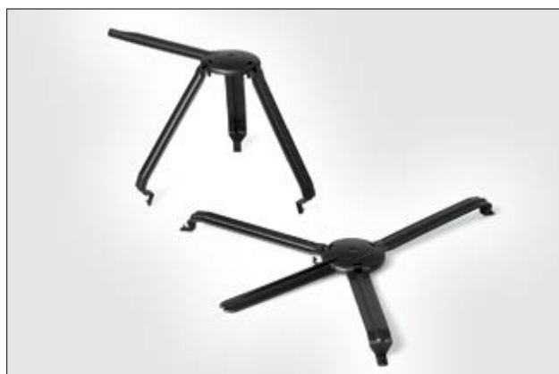
SpotClip-III downlight cover- Easy-to-mount legs with one click folding function.