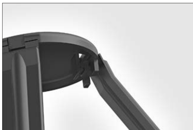
Click and fix mounting mechanism for the 3 flexible legs.