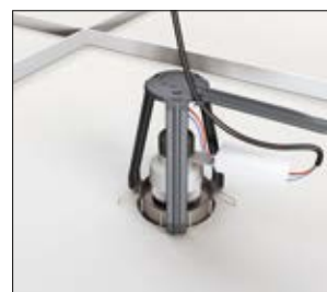
4. Connect the power supply unit and fix the cable in the cable retainer.