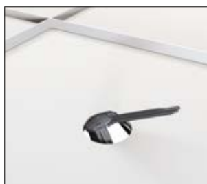
1. Insert the mounting support through the fixing hole.