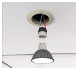
3. Connect the bulb to the socket and lock into the correct position.