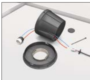
1. Mount the bottom plate over the drilled fixing hole and install the downlight housing.