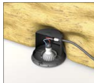
4. Insulation material can now be applied.