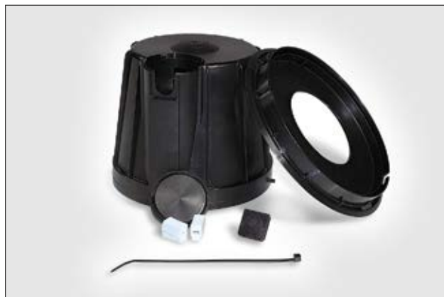
SpotClip-Box is a downlight cover supplied as a complete kit.