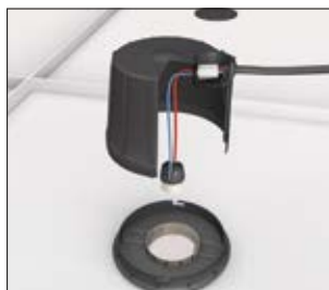
2. Connect the power supply to the lamp socket with the HelaCon Lux wire connectors included and lock it with the bayonet coupling.