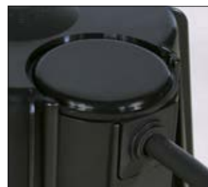
Seal the complete SpotClip-box using the end cap and grommet.