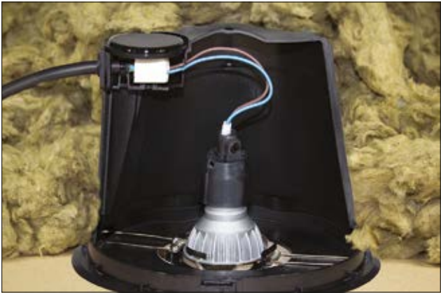
View inside the SpotClip-Box.