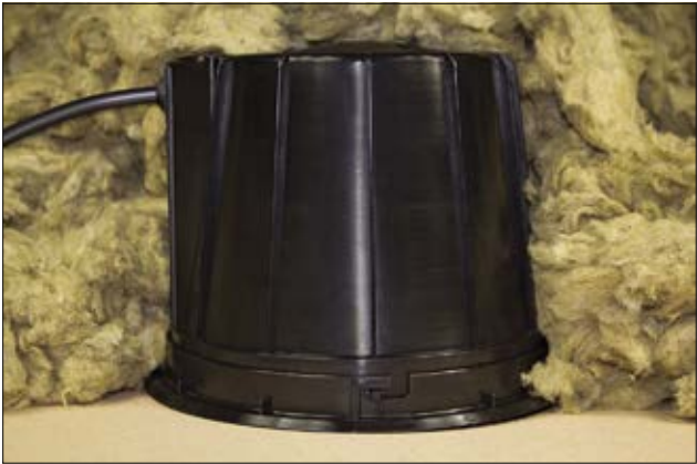
SpotClip-Box - Especially designed for passive house applications.

SpotClip-Box has been designed especially for passive houses. This innovative downlight cover prevents contact between insulation material and the bulb. The insulation remains continuous, thus avoiding any breach in the integrity of insulation in the passive house. SpotClip-Box is suitable for LED and compact fluorescent-lamp downlights with a diameter of up to 75 mm and a maximum height of 130 mm. It is available as a complete kit, including HelaCon Lux wire connectors and all necessary mounting components.