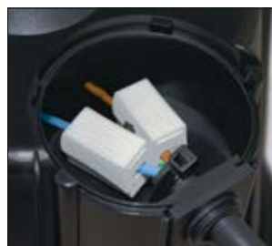
HelaCon Lux connected to the power supply.