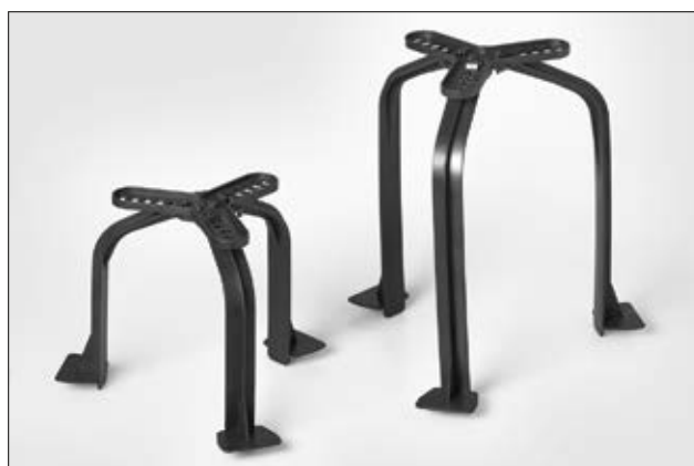
SpotClip-Kit downlight cover is available in two sizes.