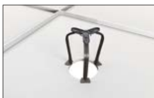
2. Press the retaining spikes into the plasterboard to secure the legs.