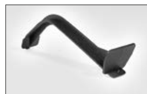
A robust design combined with retaining spikes ensures high stability.