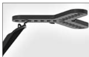
The feet position can be very easily adjusted using the click and release system.