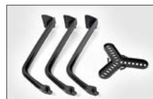
SpotClip-Kit 240 is delivered as a self-assembly set.