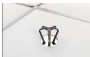
1. Squeeze the legs and insert the SpotClip-Kit through the fixing hole.