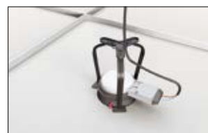
4. Connect the downlight to the power supply and fix the cable into the routing eyelet.