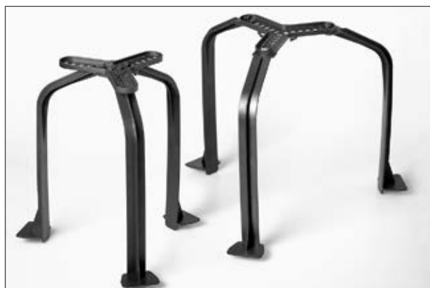
SpotClip-Kit 240 is used for fixing hole diameters from 170 mm to 310 mm.