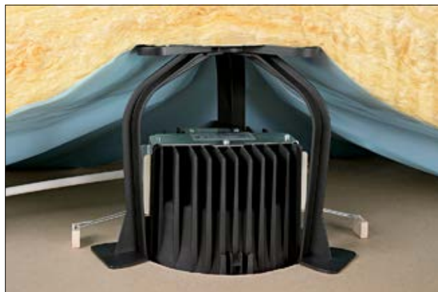
SpotClip-Kit 150 used in a suspended ceiling.