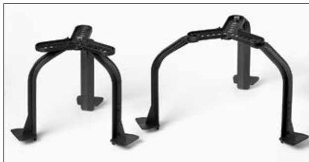
SpotClip-Kit 150 is used for fixing hole diameters from 100 mm to 270 mm.

All dimensions in mm. Subject to technical changes.