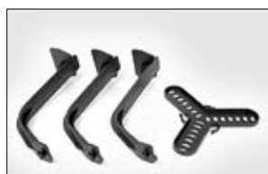
SpotClip-Kit 150 is delivered as a self-assembly set.