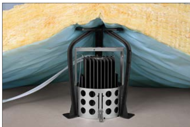
SpotClip-Kit 240 applied with a fixed sheet of insulating material.