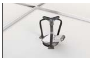
3. Install the downlight according to the manufacturer's user manual.