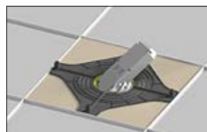
3. Insert the downlight through the cutted hole.