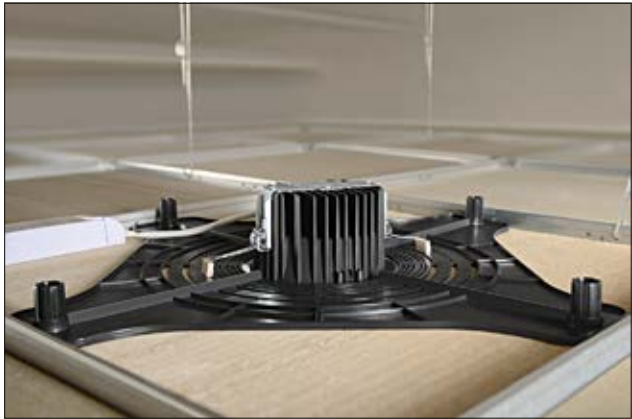
SpotClip-Plate has been developed for applications with heavy downlights in suspended grid ceilings.

SpotClip-Plate has been developed especially for installation in suspended grid ceilings in order to avoid damage and cracks in the ceiling plates caused by the weight of heavy downlights. The product dimensions of 592 mm x 592 mm mean that it fits perfectly into standard grid ceilings with a width of 600 mm. The pre-cut design makes it suitable for installation of the most commonly used downlights with a diameter from 75 mm to 314 mm. Please check if your grid ceiling size corresponds to the side length of 600 mm. Depending on the manufacturer and country this can vary between 600 mm and 625 mm.