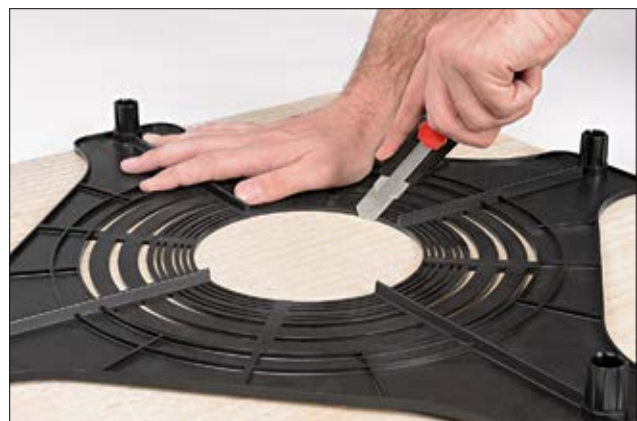
Use the SpotClip-Plate as a stencil to cut the fixing hole into the ceiling plate.