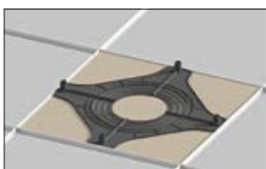
1. Place the SpotClip-Plate in position.