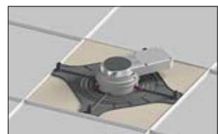
4. Mount the downlight.