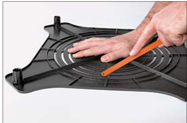
Choose the required diameter and cut with a handsaw.