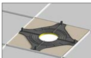
2. Cut the ceiling plate.