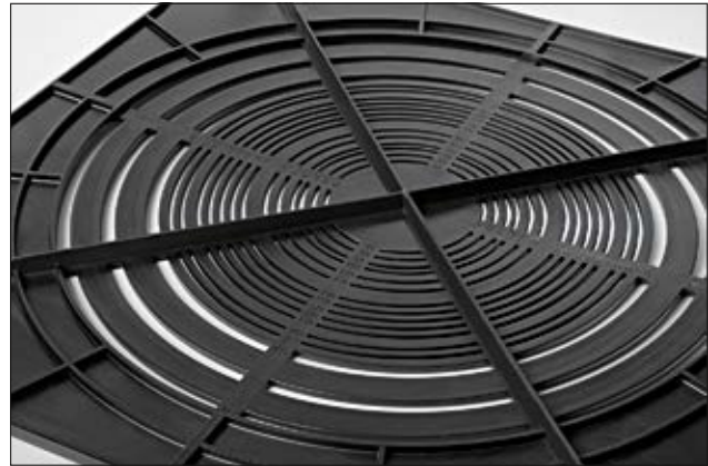
SpotClip-Plate comes in 16 pre-cut fixing hole diameter sizes.