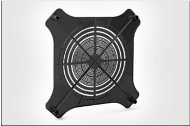
SpotClip-Plate fits perfect into standard grid ceilings with a width of 600 mm.

www.HellermannTyton.com/SpotClip-Plate-cat22