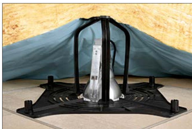
SpotClip-Plate combined with SpotClip-Kit, shown with insulation material.