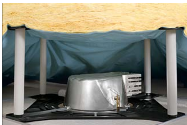
SpotClip-Plate combined with SpotClip-Caps.