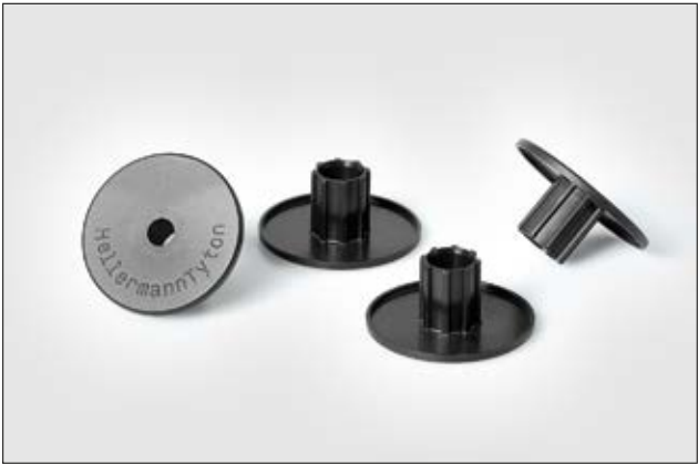
SpotClip-Caps offered in a pack of 40 pieces.