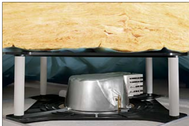
SpotClip-Plate with insulation material - Plate-to-Plate solution.