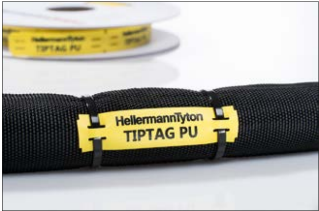
TIPTAG PU – printed mark has a tattoo-like permanency.