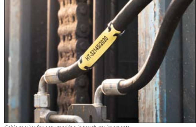
Cable marker for easy marking in tough environments.