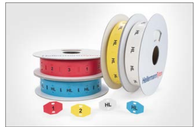
. TAGPU diamond shaped form for easy application with only one cable tie.