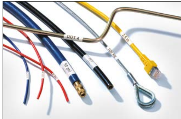
Easy marking of flexible, semi-rigid and rigid cables and wires.