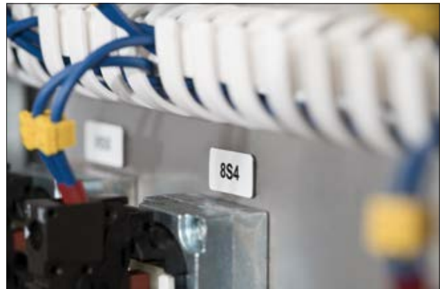
Panel labels Helatag 1220 – high performance adhesive ensures optimal adhesion to uneven surfaces.