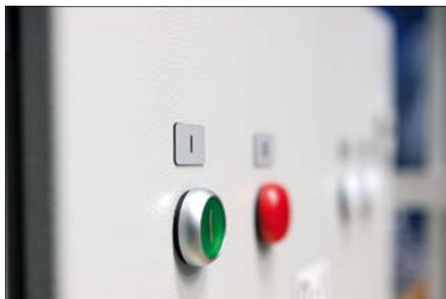
Panel labels are an ideal replacement for engraved plates.