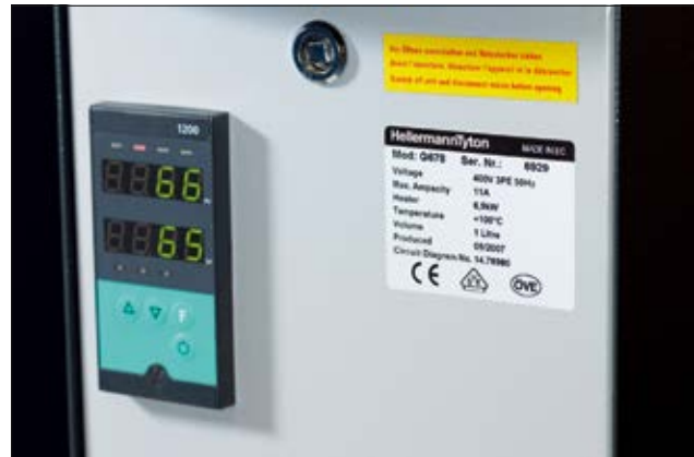
Professional type plate on a heating unit.