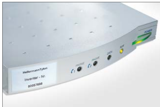
Helatag labels for permanent asset identification.