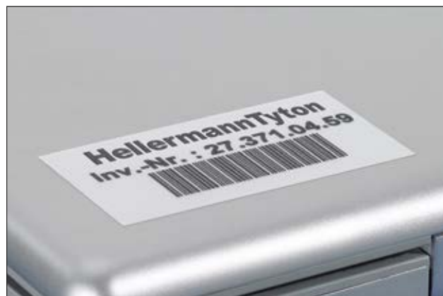
Highly visible and clearly printed labels identify quality assets.