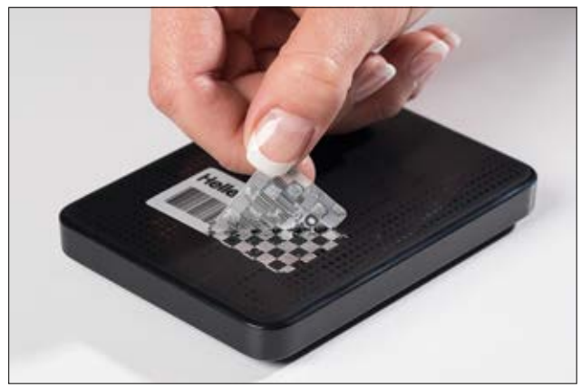
Highly visible tamper evidence.