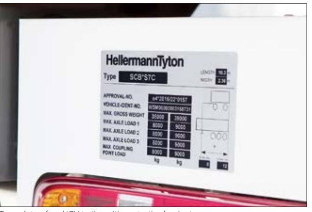
Type plate of an HGV trailer with protective laminate.