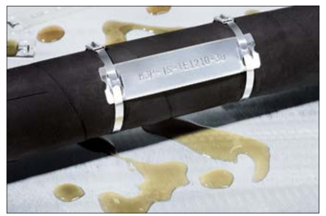
Marker plates designed to survive the harshest environments.