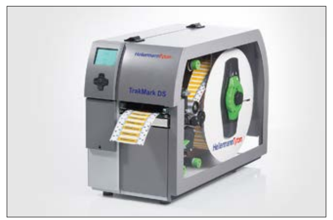
TrakMark DS printer - for double sided printing.