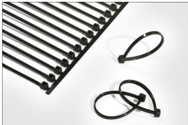
Cable ties for Autotool 2000 systems.