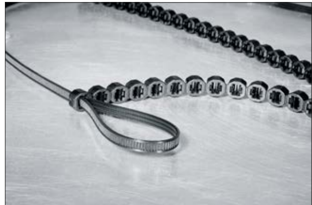
Closures and strap for Autotool System 3080.