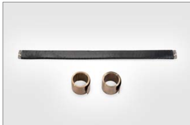
(2) Constant force springs with copper earthing braid.