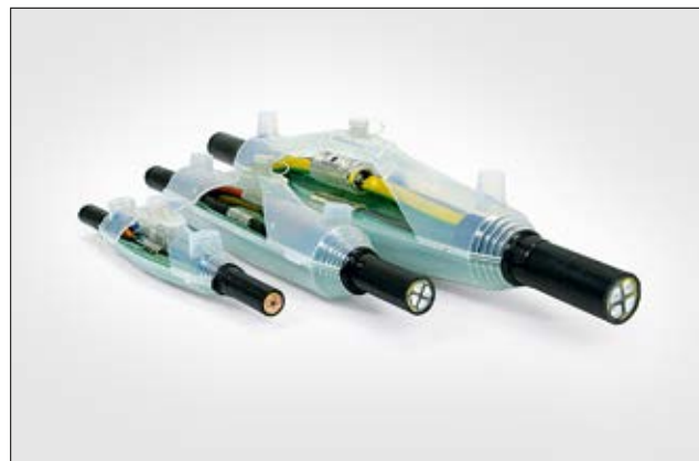
Straight-through joints i-Line SF (safe-filling) / Straight through joints i-A Line SF (safe-filling) – Armoured.