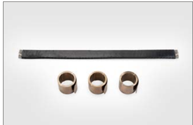
(3) Constant force springs with copper earthing braid.