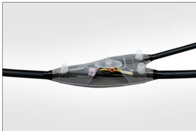
Branch joint Y-Line SF (safe filling) / Branch joint Y-A Line SF (safe filling) – Armoured.