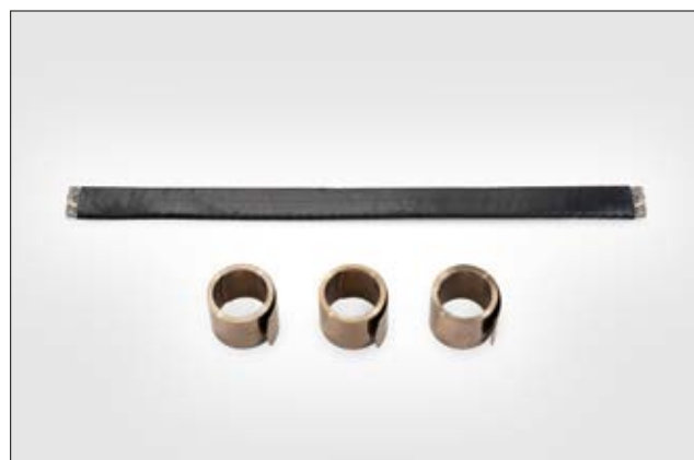
(3) Constant force springs with copper earthing braid.