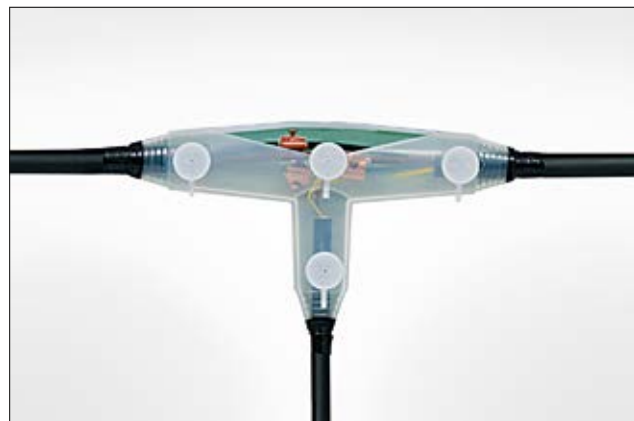
Branch joint T-Line SF (safe filling) / Branch joint T-A Line SF (safe filling) – Armoured.

RELICON cast resin joints for armoured cables are suitable for polymeric cables with earth bonding/continuity of SWA and STA. The transparent two-chamber resin bag makes the mixing process visible and therefore more reliable. Included all necessary earth continuity parts that suits the complete range of the joint and consists of constant force springs with straight ends for easy installation without any classical injuries. The range of the constant force springs is also printed on the constant force spring to make installation comfortable and to avoid mistakes. Relicon branch joints are also suitable for cut and uncut mains and the PA-Line even for double service cables. Application: Public and private networks, In- and outdoor, above ground, underground or submerged, cable ducts