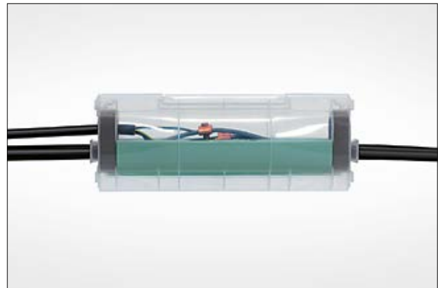
Parallel branch joint PA-12 75/300.