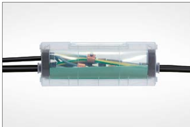
Parallel branch joint PA-13 95/420.