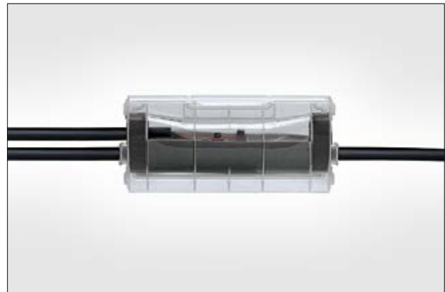
Parallel branch joint PA-11 PUR 771.