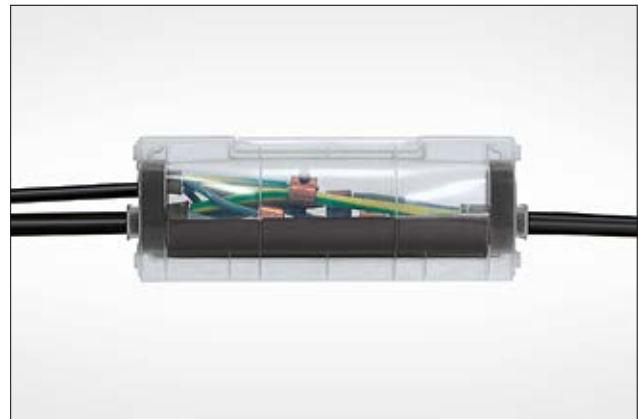
Parallel branch joint PA-13 PUR 771.