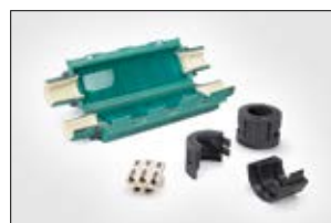
Gel cable joint Reliseal V 525.