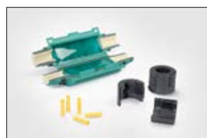
Gel cable joint Reliseal V 56.