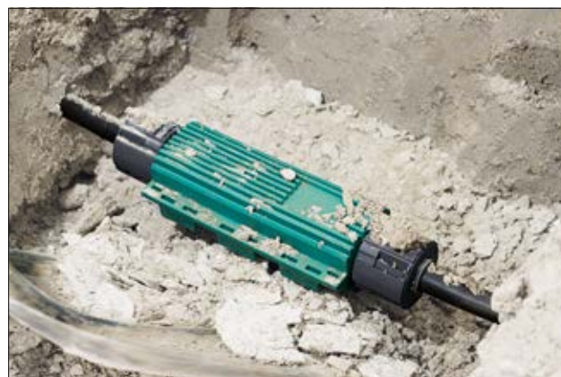
Reliseal gel cable joint, available in three sizes.