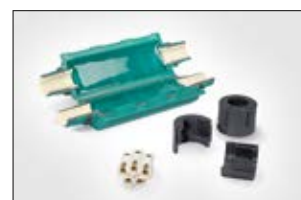
Gel cable joint Reliseal V 510.