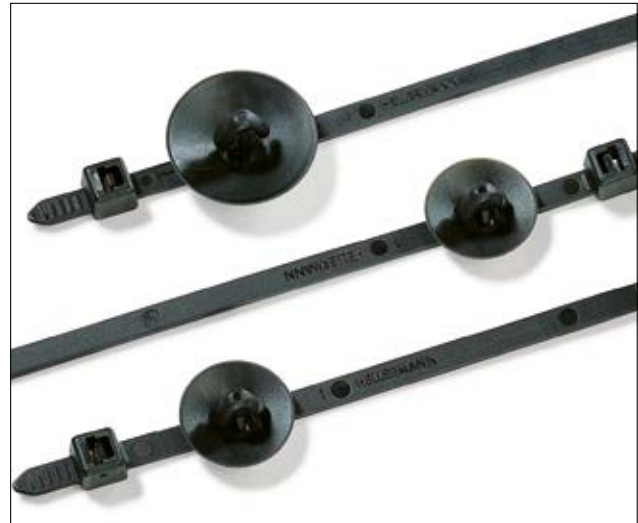
The 'tab' on the head of the tie makes it easy to locate and lift the head for assembly.

Material specification please see page 30.