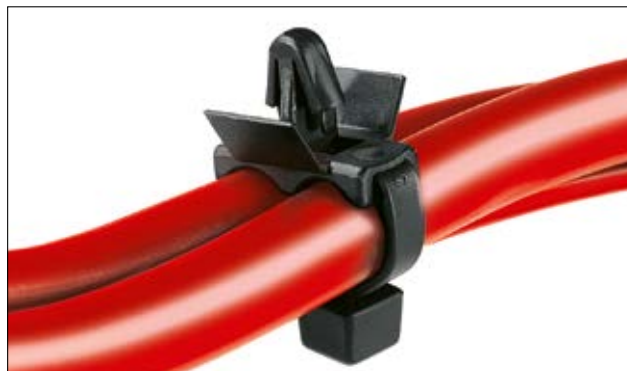
Designed to secure battery cables the T80RSF6.5F offers a simple and secure fixing.