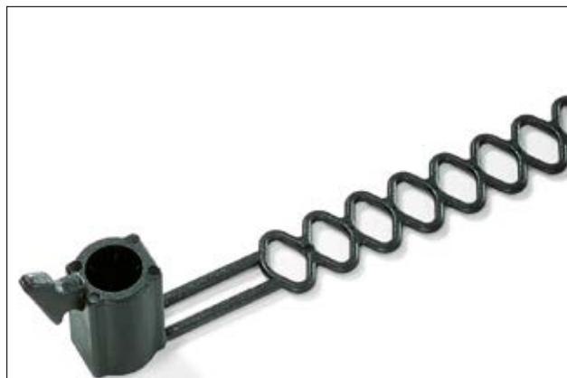
FBB one piece fixing ties for weld studs, can be easily removed by unscrewing in an anti-clockwise direction.

Material specification please see page 30.