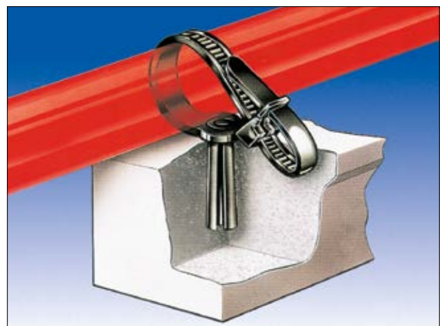
Wall plug tie in application.