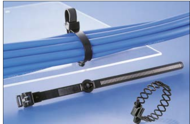
Fixing ties with rivet for especially safe fixing.