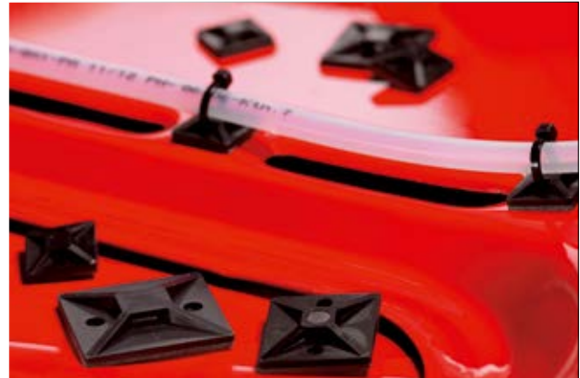
SolidTack products work on varnished and powder coated surfaces.

Material specification please see page 30.