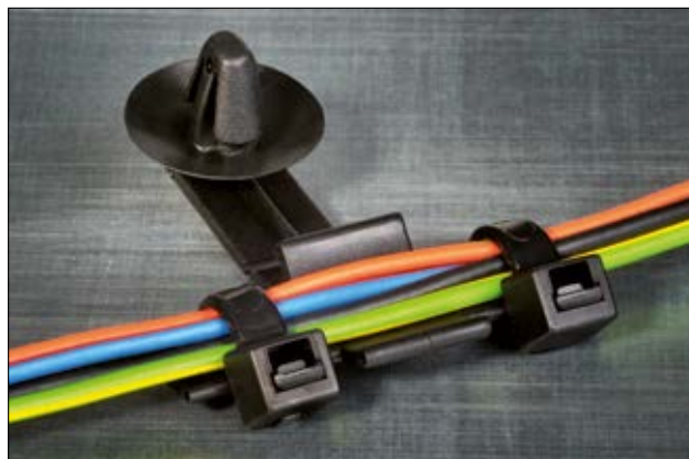
StandOff Clips allow cable looms to be routed at a set distance from the punched holes.