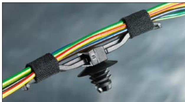
The CHA2 with fir tree base and length tolerance compensation for precise cable routing even in difficult conditions.