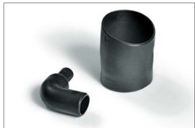
1108-1 supplied / fully recovered.