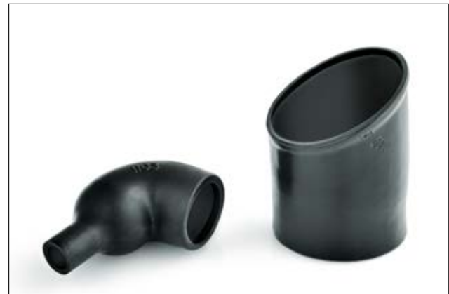
1108-4 supplied / fully recovered.