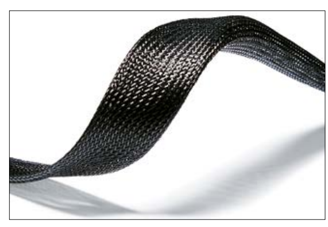
Helagaine HEGPL Braided Sleeving.