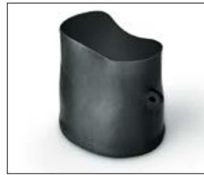
150 Serisi satıldığı şekliyle.