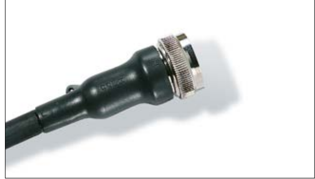
150 Serisi şekillendirilmiş hali.