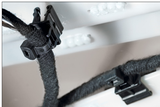
T50ROSEC10 fitted onto a plastic panel to hold a Ø 6 mm harness.