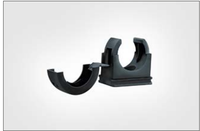
HelaGuard PACC Conduit Clip.