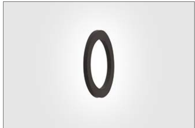
HelaGuard AWS Chloroprene Sealing Washers.